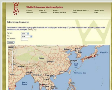
Screenshot of WEMS software.

AIT and United Nations University (UNU) have signed a formal licensing agreement for implementation of