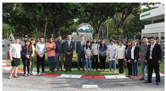
AIT scholarship recipients with ADB officials.