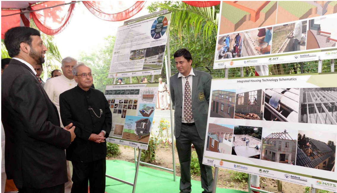
President Pranab Mukherjee (center) at the foundation stone laying ceremony at Ashiana, Dehradun, India.