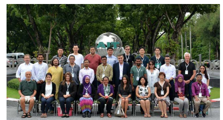
APSIG participants at AIT.

Thirty-seven participants from 19 countries participated in the 2016 Asia Pacific School of Internet Governance organized by intERLab from 12-15 September 2016 at AIT.