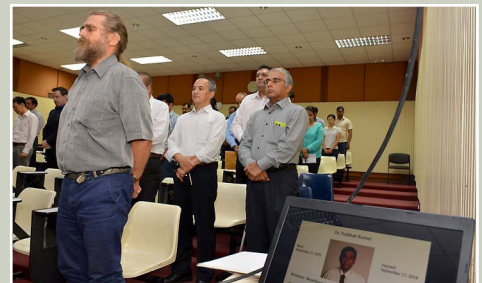
Condolence meeting at AIT.