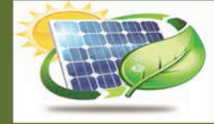
Solar & Renewal