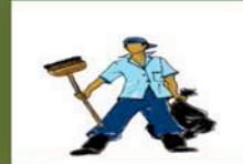
Toilet & Sanitation